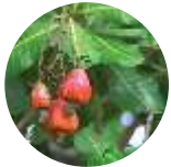
3 Cashew Nuts Trees In Each Plot