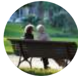
Senior Sit out